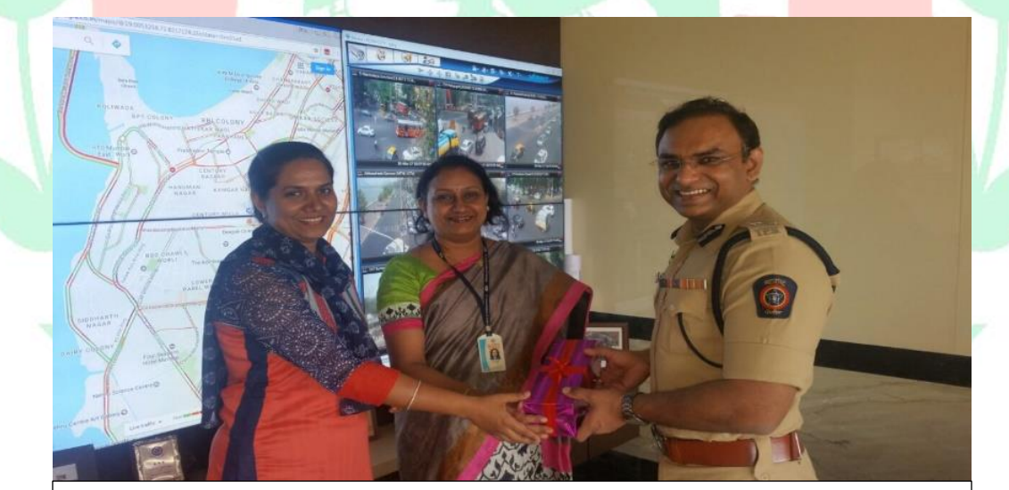
Faculty felicitating Traffic Police Officer