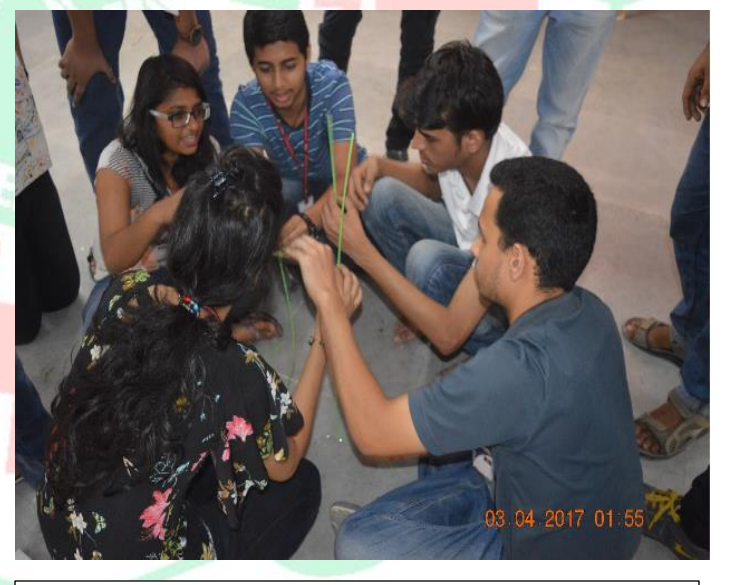
STUDENTS PARTICIPATING IN ECELL DAY ACTIVITIES

All these speakers shared their experiences with the students as it shall familiarize them with the core skills required to be an entrepreneur as well as the need and benefits of being one, which subsequently, shall enable them to work towards their own entrepreneurial venture.